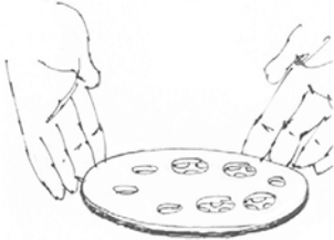
A) For 5 or 8 hole sanders, remove 8 plugs B) Rotate to maximize hole exposure C) Align loop disc with edges of carbide disc