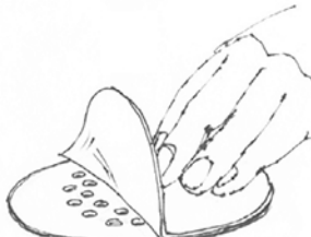
D) Hold half of loop pad in place E) Peel backing and apply other half of loop F) Gently smooth into place by hand